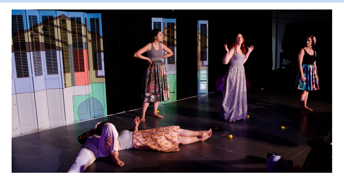
"A wet hurt and a yellow stain and a high wind and a color stone, a place in and the whole real set all this and each one has a chin."