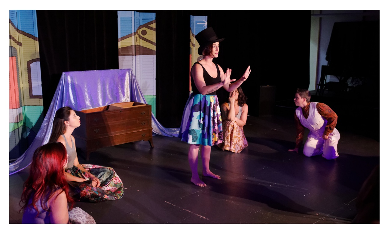
"A spread out case is so personal it is a mountain of change and any little piece is personal, any one of them is an exchange."