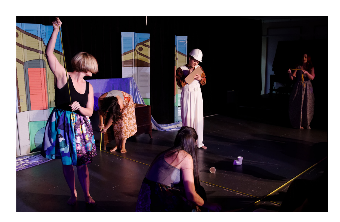
"Show much blame in order and all in there."

"She was not any more gay but she was gay longer every day than they had been being gay when they were together being gay."