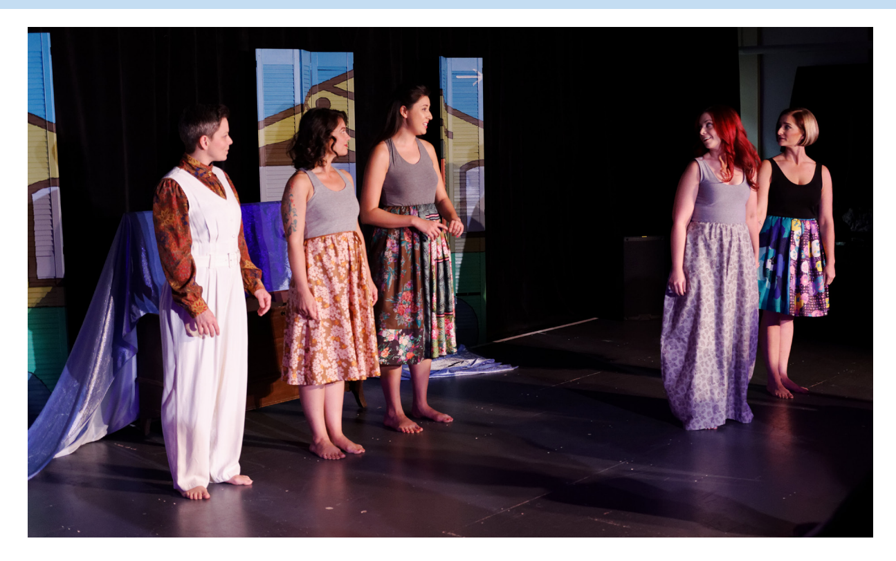
"Show the shout, worry with wounds, love out what is a pendant and a choke and a dress in together."